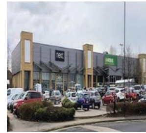
UKV II - Morecambe Retail Park