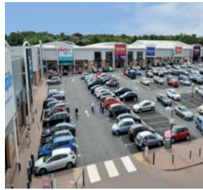
UKV I - Telford Retail Park