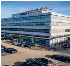
EUV I - Vodafone Office Building