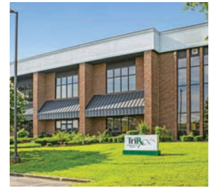
TriRX Pharmaceutical Manufacturing Facility