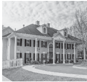
USV IV – St. Augustine Senior Housing