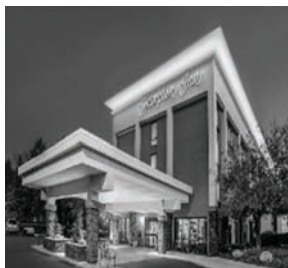
USV III Hospitality