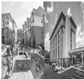
USV II Multifamily, Hospitality