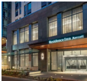
USV VII - RI Seattle Hospitality