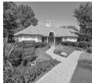
USV III Multifamily