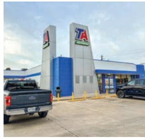
TA Alameda Travel Center