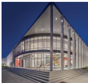
Axalta Corporation Class "A" Office