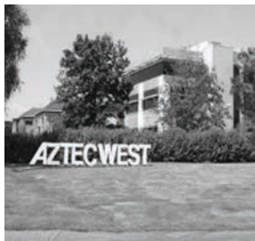
Aztec Office Building