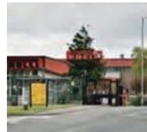
UKV V - Pirelli Industrial