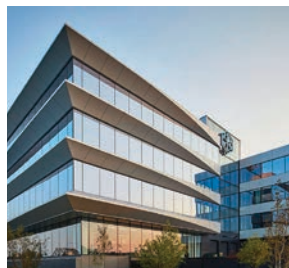
USV IX CHR Class "A" Office