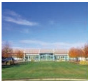
HPE - Roseville Class "A" Office