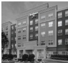
USV IV – RI Boston Hospitality