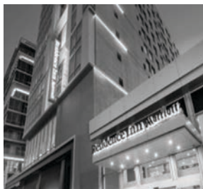
USV V – Residence Inn Hospitality