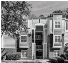
USV I – Hamilton Ridge Multifamily