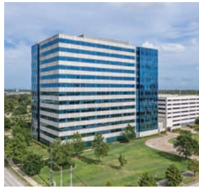
Energy Center 1