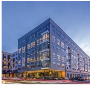
Alta Federal Hill Multifamily