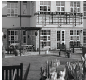
Prime Life Ltd. Senior Housing