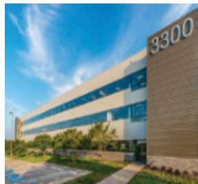
USV VIII - Genpact Office Building