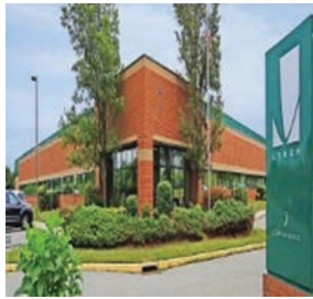
USV VI Industrial Lease Fund