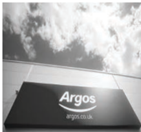
Argos Distribution Centre