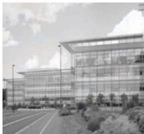
Utility Wise Class "A" Office