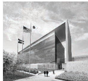
GSA – FBI Office Office Building