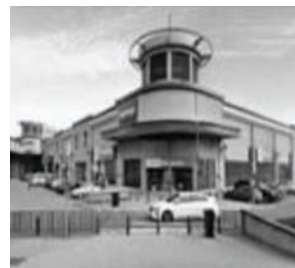
UK Venture III Retail Park