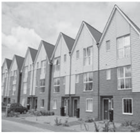
Parham Student Village Student Housing