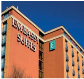
USV I - Embassy Suites Hospitality